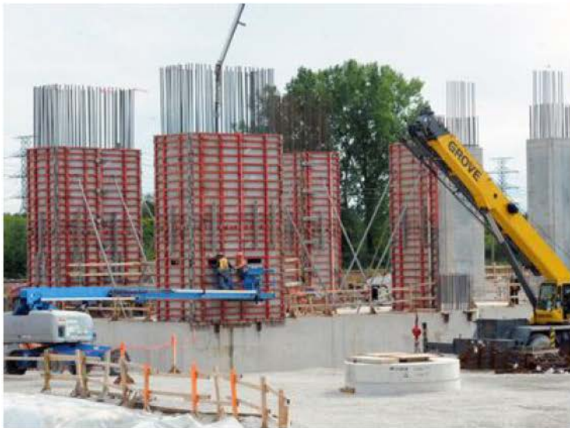
*Plant construction as of 28 September 2011